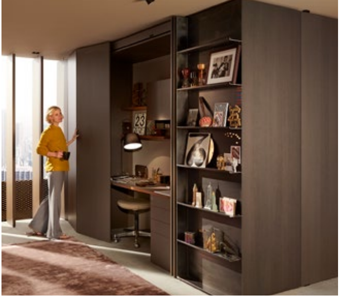
Turn the living room into a home office with a single touch