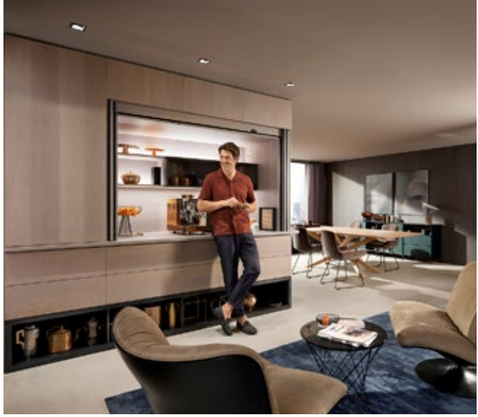
REVEGO also stands for extraordinary solutions