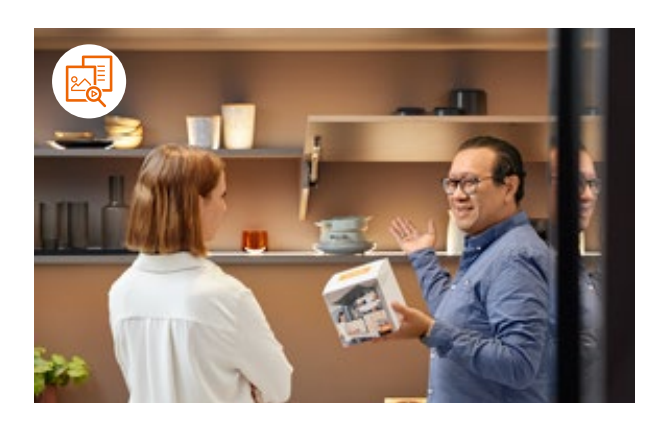
Communication services Comprehensive material for targeted marketing