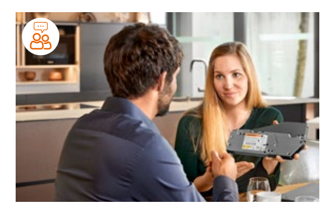
Personal services Direct contact for customer-focused support