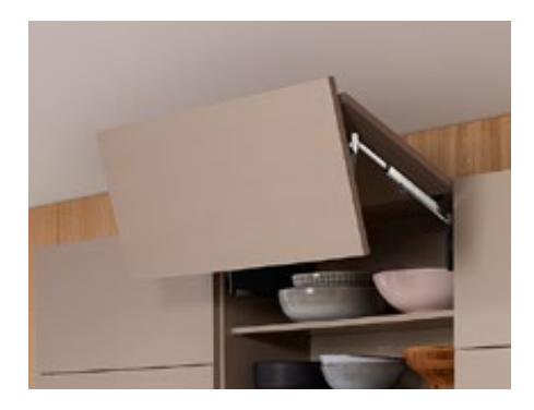
AVENTOS HF top – bi-fold lift system The solution for high wall cabinets with bi-fold fronts. Little space is needed above the cabinet.