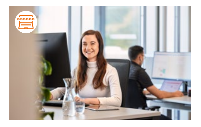
Digital services Digital support for greater efficiency