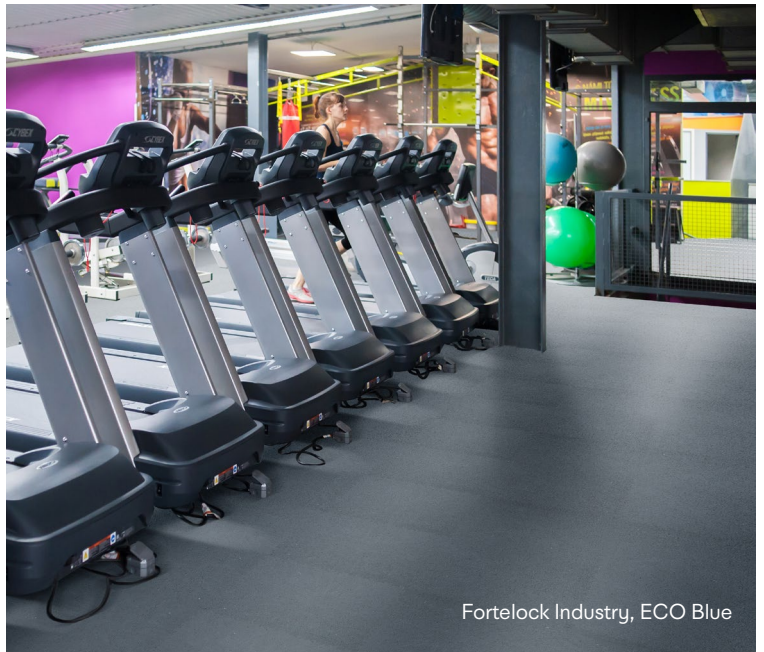
Fortelock Industry, ECO Blue

Not only will we save plastics from landfill, but we will also save 5,496,00 kg of CO 2 per year, equivalent to the emissions of almost 1,000 cars and save 725,000,000 litres of water.