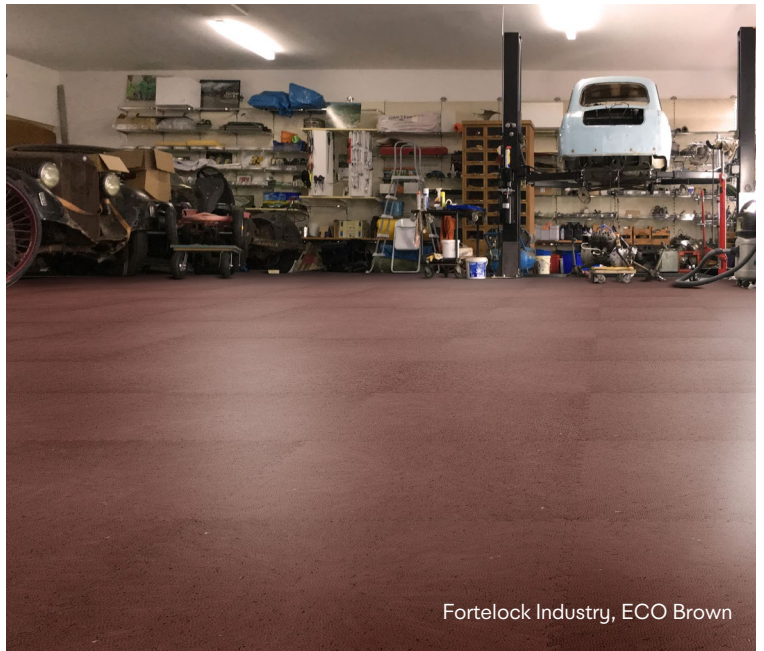
Fortelock Industry, ECO Brown

Do you know where the new colours are particularly suitable?