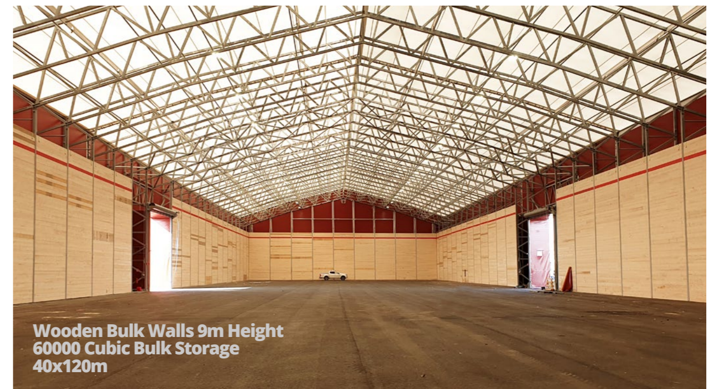
Wooden Bulk Walls 9m Height 60000 Cubic Bulk Storage 40x120m