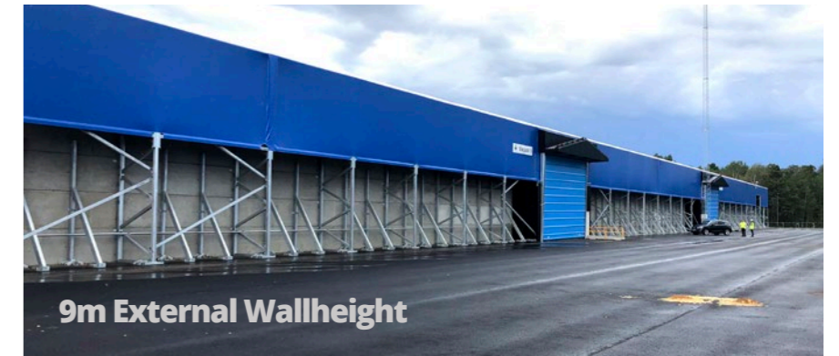
9m External Wallheight