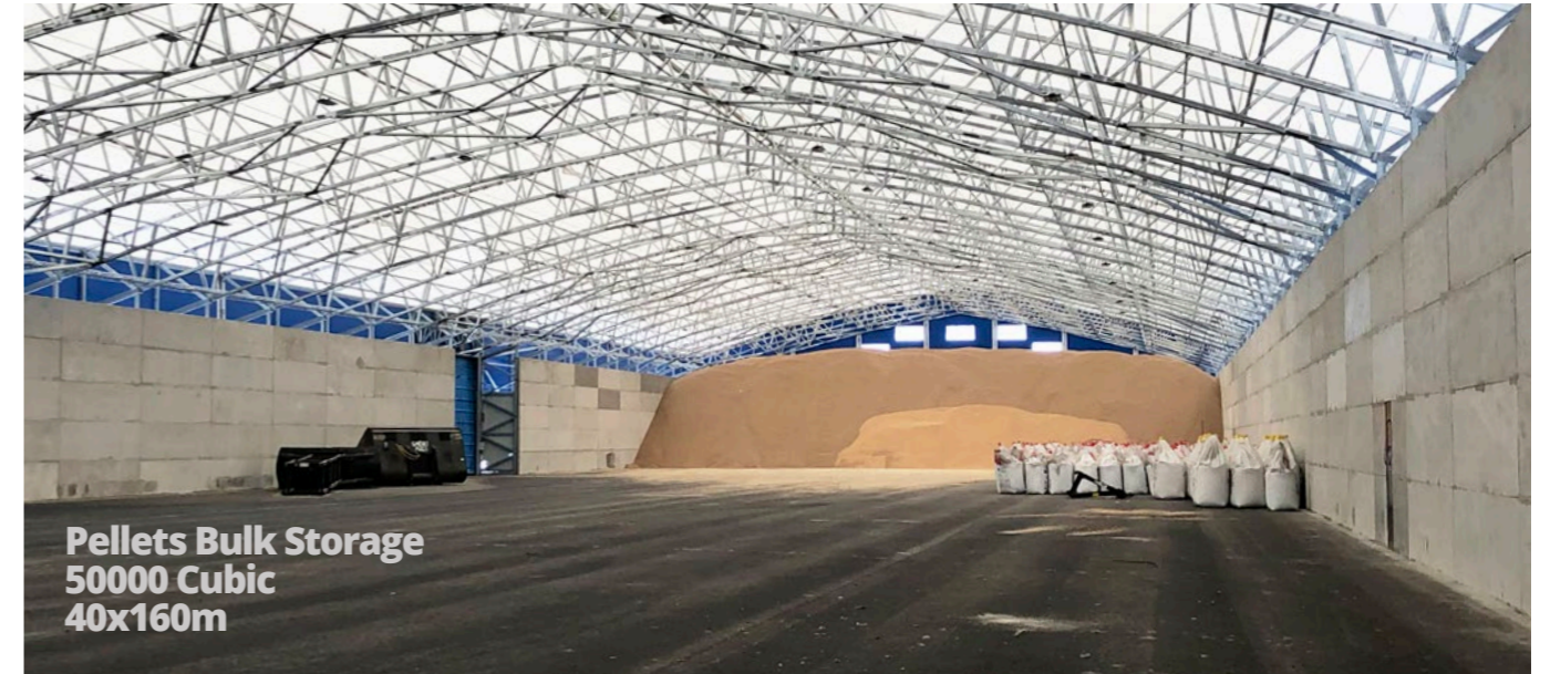
Pellets Bulk Storage 50000 Cubic 40x160m