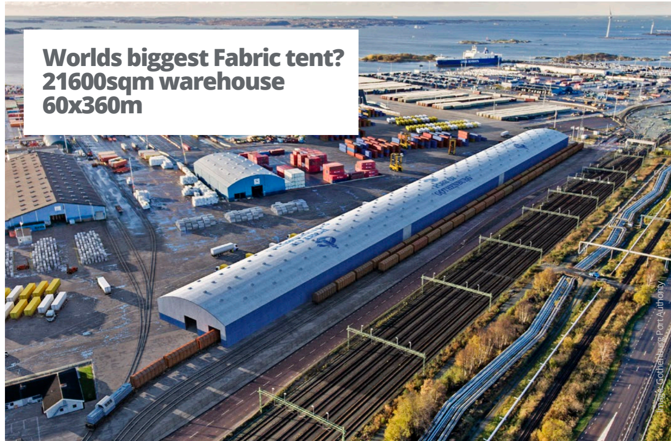
Worlds biggest Fabric tent? 21600sqm warehouse 60x360m

Hallgruppen is a specialist in design, manufacture and construction of custom made structures for all climates